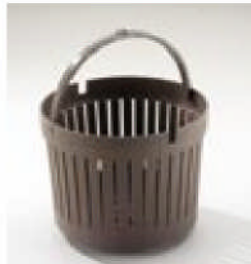
Standard Instrument Basket 219292