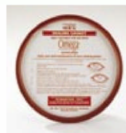
Omega Sealing Gasket 229216