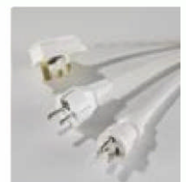
Cord Sets UK 219258 Euro 219297 UL 219299