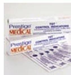
TST Indicator Strips 219277 126°C 259277 121°C