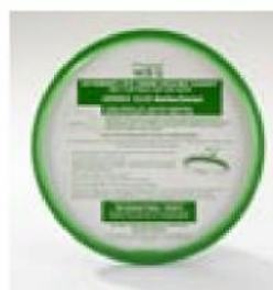
2100 Classic Sealing Gasket 219500