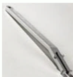
Lifting Device 219294