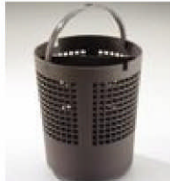
Extended Instrument Basket 219296