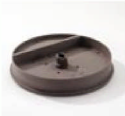
Instrument Tray Classic 219293 Omega 229310