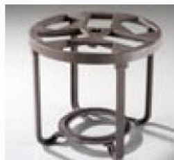
Cassette Rack Classic 219290 Omega 249025