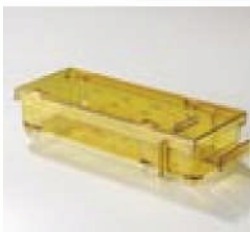
Dental or Small Cassette 219291